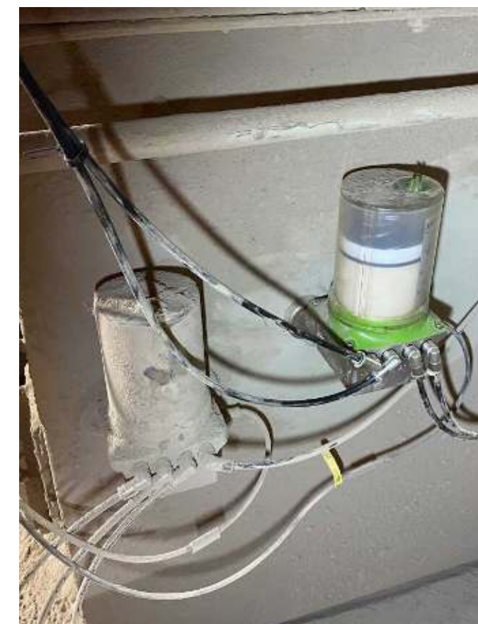
Automatic Lubrication of Paddlemix bearings

Post installation, we provide follow up inspection service in addition to a service contract for monthly monitoring. This is where our engineer will call to site each month, check functionality & produce a full report to suit in-house Preventative Maintenance Systems.