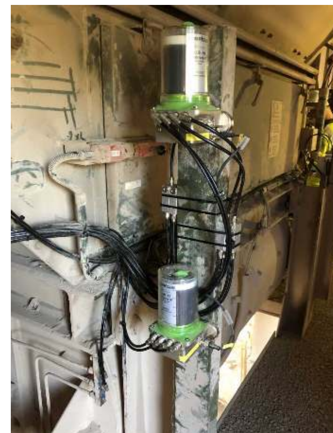
Automatic Lubrication of Aggregate Doors