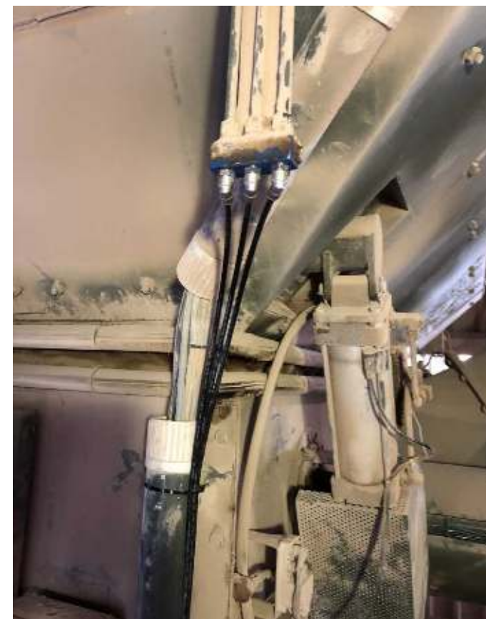
Automatic Lubrication of Hot Aggregate Bins