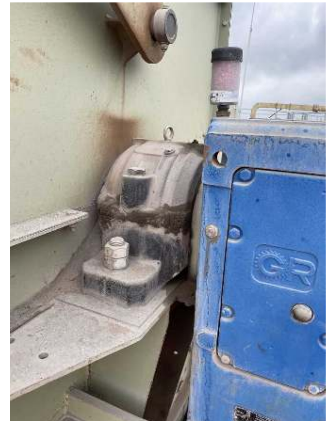
Automatic Lubrication of Hot Stone Elevator Bearings