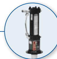
Hydraulic Dyna-Star Pump – 2000